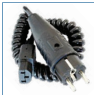
Network test lead